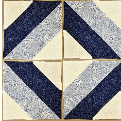
Take 4 of the Diagonal Stripe Blocks and arrange them to make a Lattice Diamond Motif.