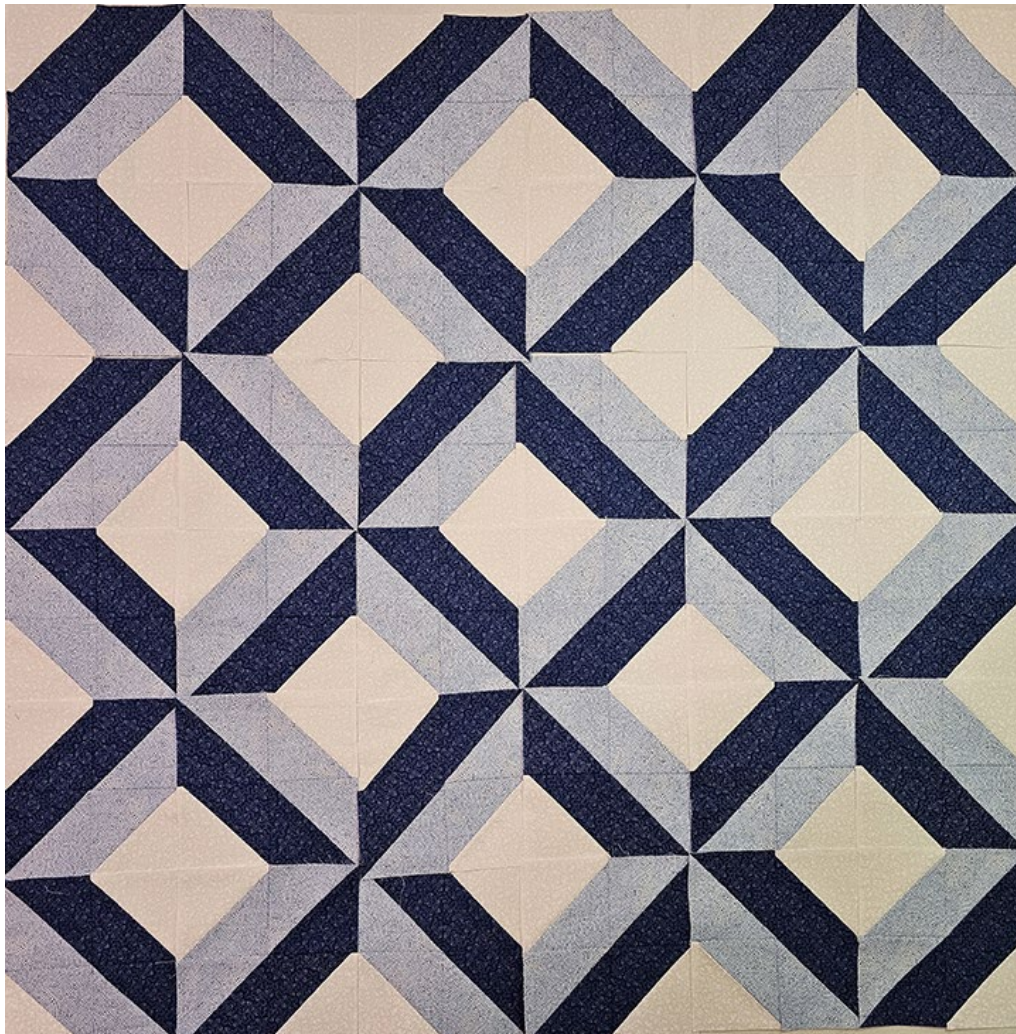
This quilt has 9 diamond Lattice motifs arranged in simple rows.