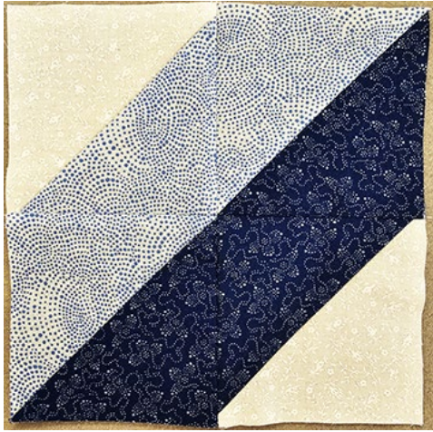
Sew the blocks together to make a Diagonal Stripe Block.